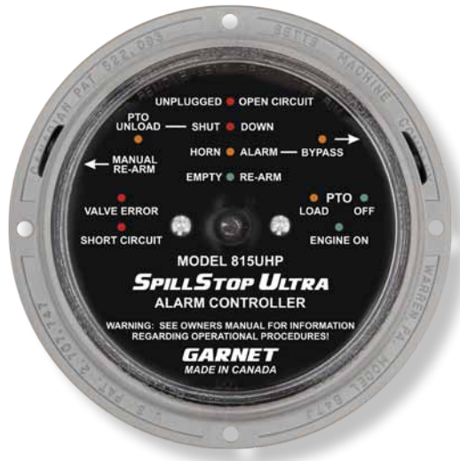
Single Compartment Model 815-UHP

The SPILLSTOP ULTRA™ Alarm Controller works in conjunction with the SEELVEL SPECIAL™ 808-P2 or the SEELVEL PROSERIES II™ 810-PS2 truck gauges to provide truck tank overfill protection and assists in preventing spills due to blown hoses.