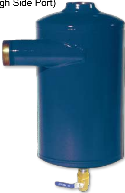
Oil Separator (Pump Connection Through Side Port)