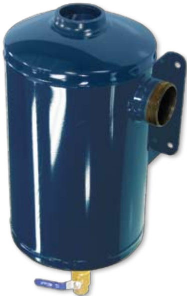
Oil Separator with Demister Pad (Pump Connection Through Top)