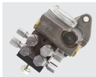
Automatic adjustment free mechanical oil pump