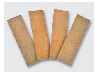
Heat stabilized Kevlar vanes machined to exacting tolerances