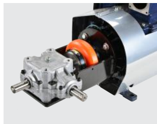
Integral mounting bosses guarantee alignment with gearbox and hydraulic mount