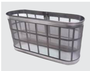
Washable stainless steel Inlet Filter for long filter life

Superior reliability and performance features built into every Masport pump